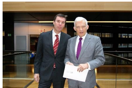
Mr. Silvio Danailov & Prof. Jerzy Buzek

Web site: www.danailov-for-president.com