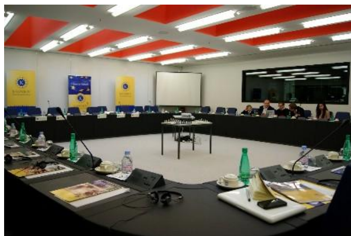
One of the two halls for the presentation of the project