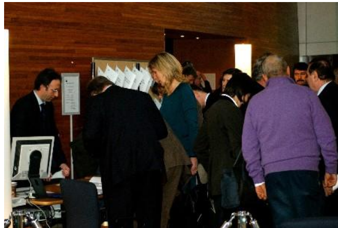
MEPs are signing the Written Declaration no. 50/2011