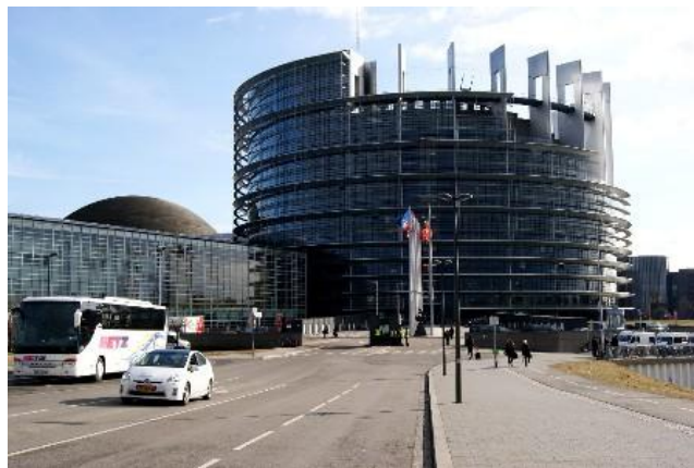
The European Parliament in Strasbourg, France

The Written Declaration will be officially communicated from the Parliament to the Commission and to the Parliament of each EU Member State together with the list of signatories.