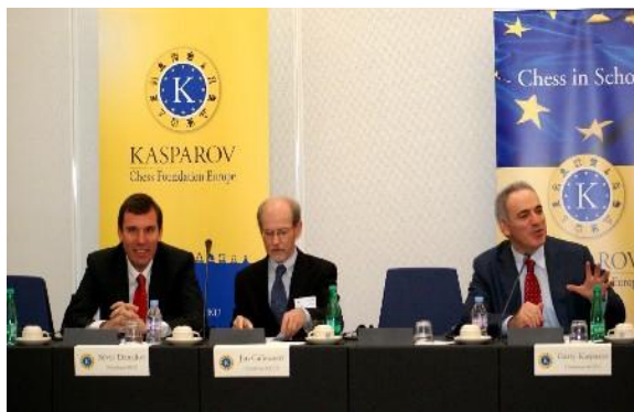
The presentation of the “Chess in school” project