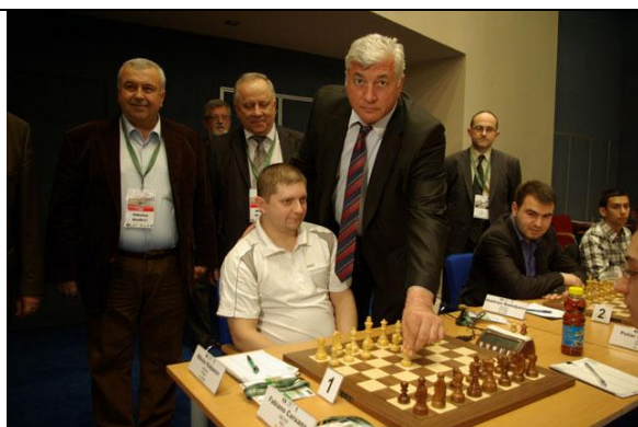
The first symbolic move made by the Governor of Plovdiv, Mr. Zdravko Dimitrov

The 13 th European Men's Individual Chess Championship has started on 19 th of March and will continue until 1 st of April, 2012 in Plovdiv, Bulgaria. The Championship is organized by the European Chess Union and the Bulgarian Chess Federation.