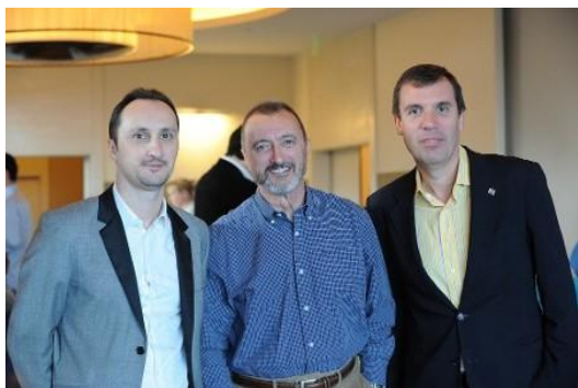
V.Topalov, A.Perez-Reverte, S.Danailov

25 March, 2011 - The President of the European Chess Union, Silvio Danailov, met with the worldwide famous Spanish writer Arturo Perez-Reverte during the prestigious Melody Amber chess tournament in Monte Carlo.