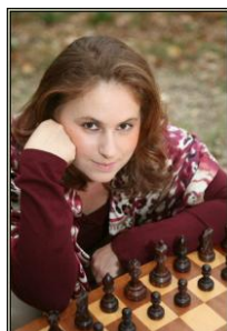
Judit Polgar (HUN)